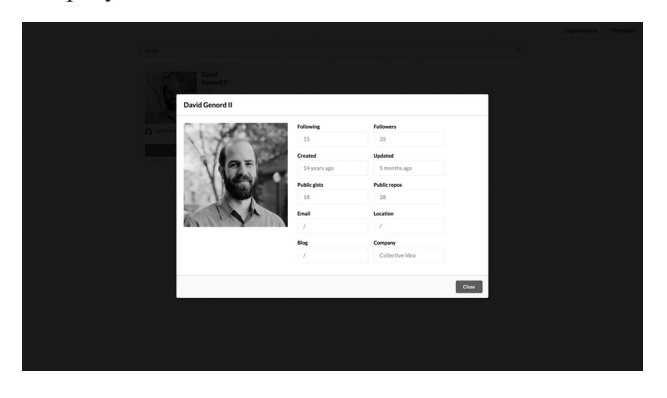
Fig. 5. Review of a member's profile within GitHub organization

Fig. 5 shows the review of a member's profile within GitHub organization. Some of the data are: number of followers, number of public repositories, location, email, company, etc.