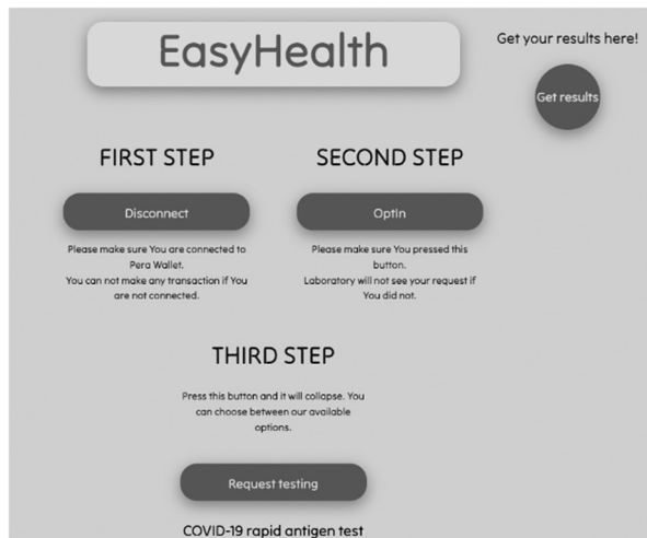
Fig. 6. EasyHealth application

An application was developed using the React framework, which should allow the Patient to request a quick test for the Covid-19 virus, after which the Laboratory, based on the blood sample, returns the test results. The front end of our EasyHealth application is shown in Figure 7.